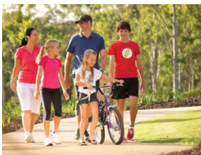
Oran Park Podium

Set to become the cornerstone of education, business, service and entertainment in the area, Oran Park Town offers a modern family lifestyle with easy access to contemporary amenities including its own town square with shopping and civic facilities. Concourse at Oran Park is an address master planned for family living with plenty of parks with playgrounds, sports fields, education, dining and entertainment options all on your doorstep.